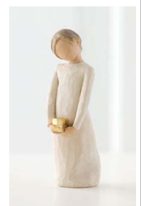
"Spirit of Giving"