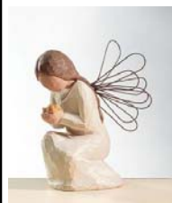
"Angel of Miracles"