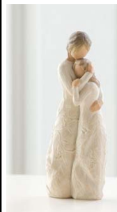
"Close to Me"

More new pieces now in the Bookstore from Willow Tree