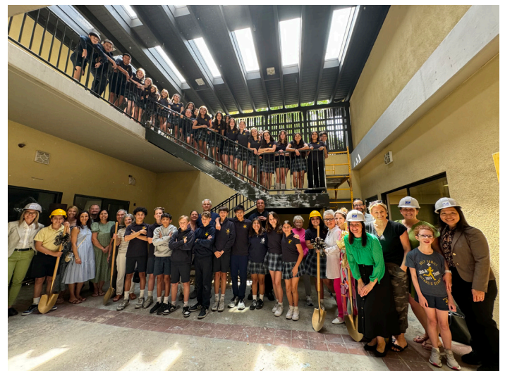
Education Center Groundbreaking