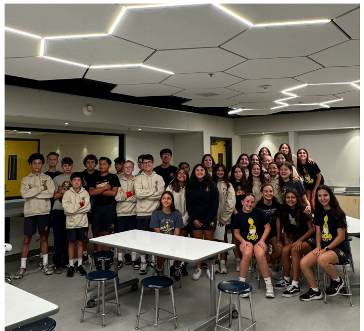
2024 Education Center Basement Completed Remodel