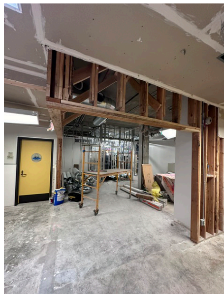
Summer 2024 Education Center Construction