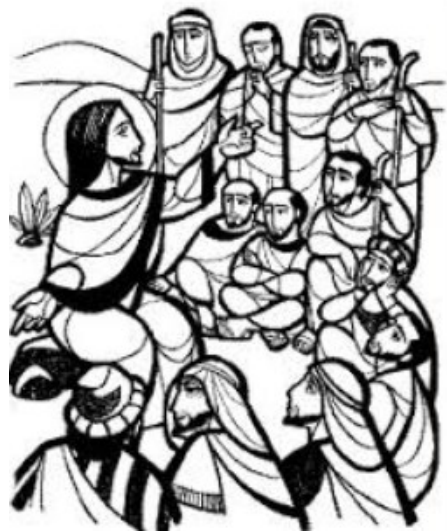
Gospel of the Lord